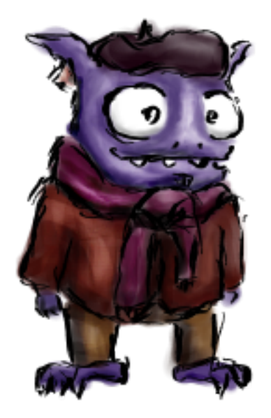
Fig. 1: Figure 1: Cute goblin with a beret. Illustrated by Chris Webber