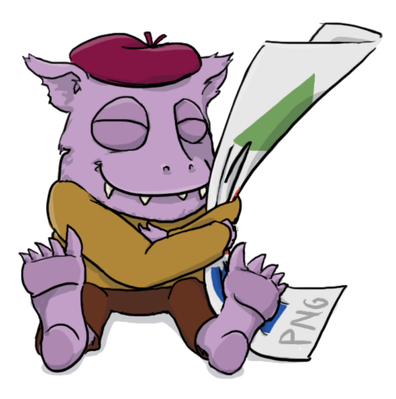
Fig. 2: Figure 2: Snuggly goblin. Illustrated by Karen Rustad